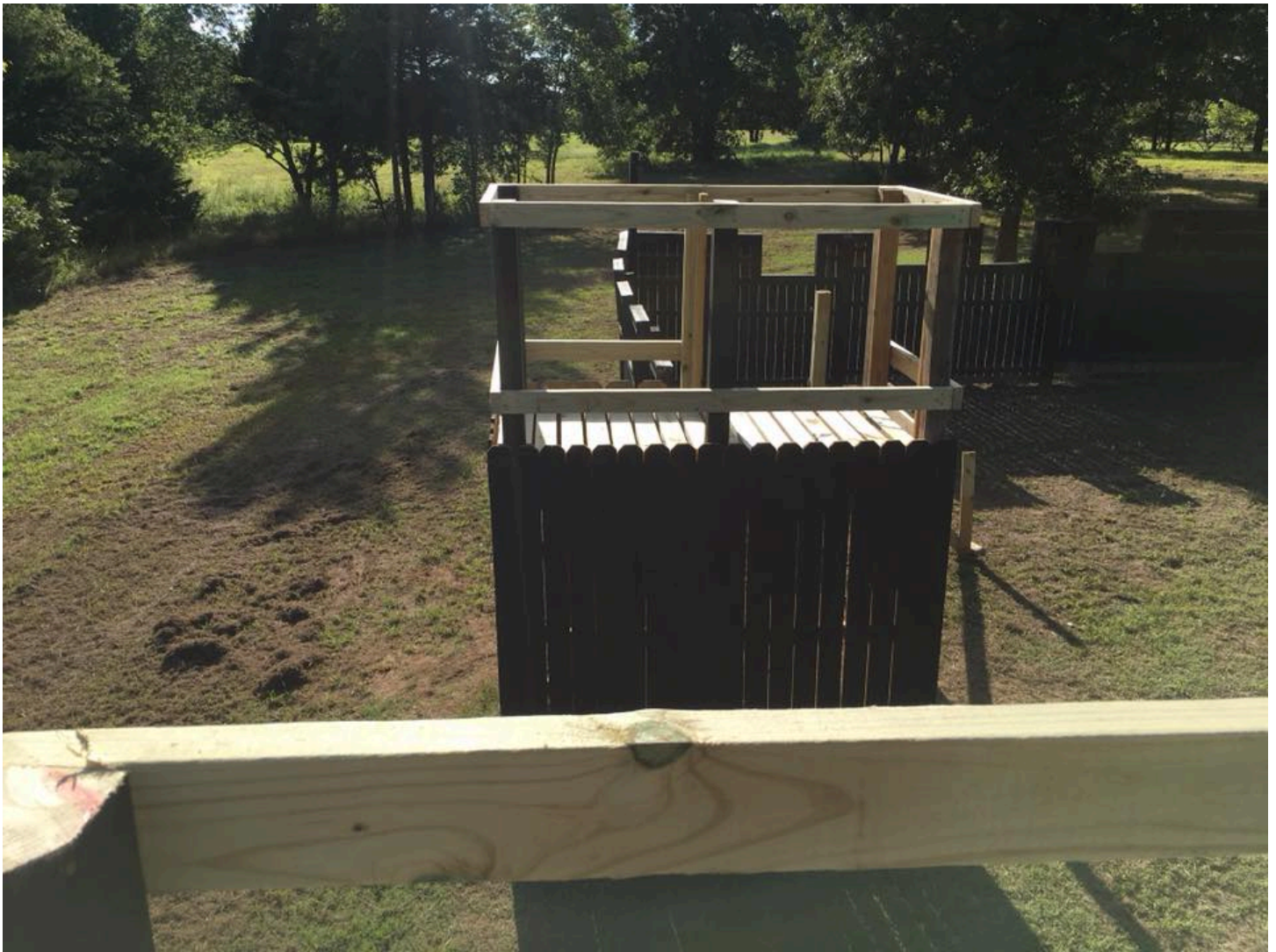
View of the archery platforms