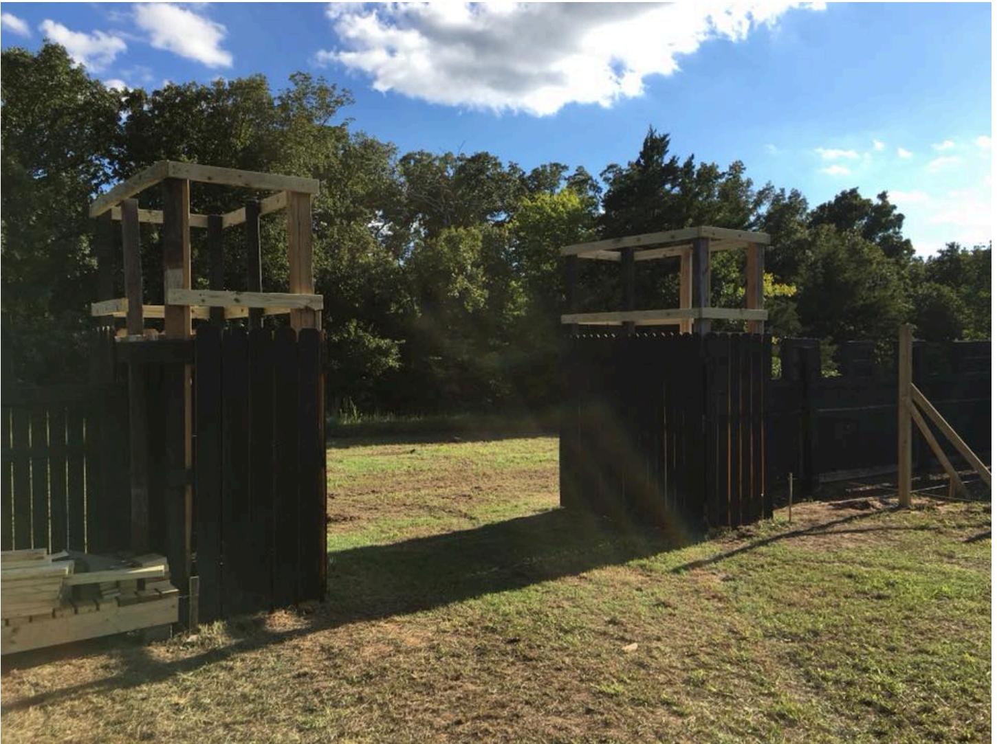
Rear gatehouse archery platforms with the beginning of the catwalk

We managed to get a small group out to the Fort on August 11, 2018 for some clean-up and planning, but the main work wasn't started until September 8 th . This time the goals were to dig holes and set posts in concrete for the front gate, build the front gatehouses, add decking to the gatehouses to make them archery towers(!), touch up some paint, and clean fasteners out of old boards for re-use. Even with the mid-wall supports built, the walls still tended to sag if even the smallest person leaned against them, so after some discussion the plan was made to add catwalks around the full interior wall of the Fort. We were able to lay out the start of the catwalks this time around.