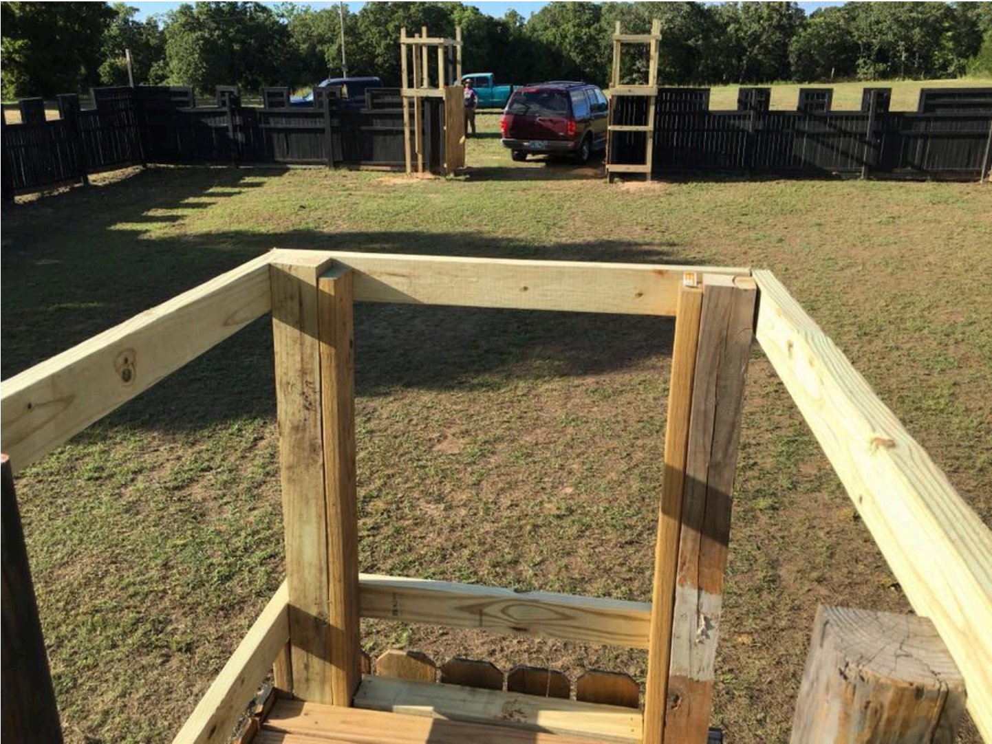
View of the front gatehouses from the rear archery platform