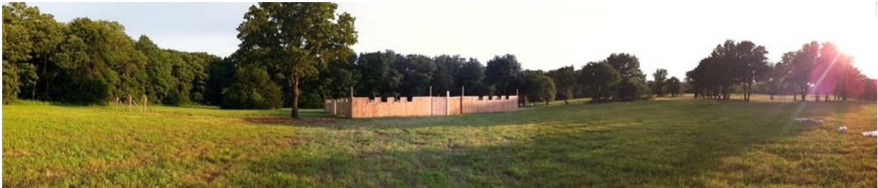
Original Fort at Castellan 2012