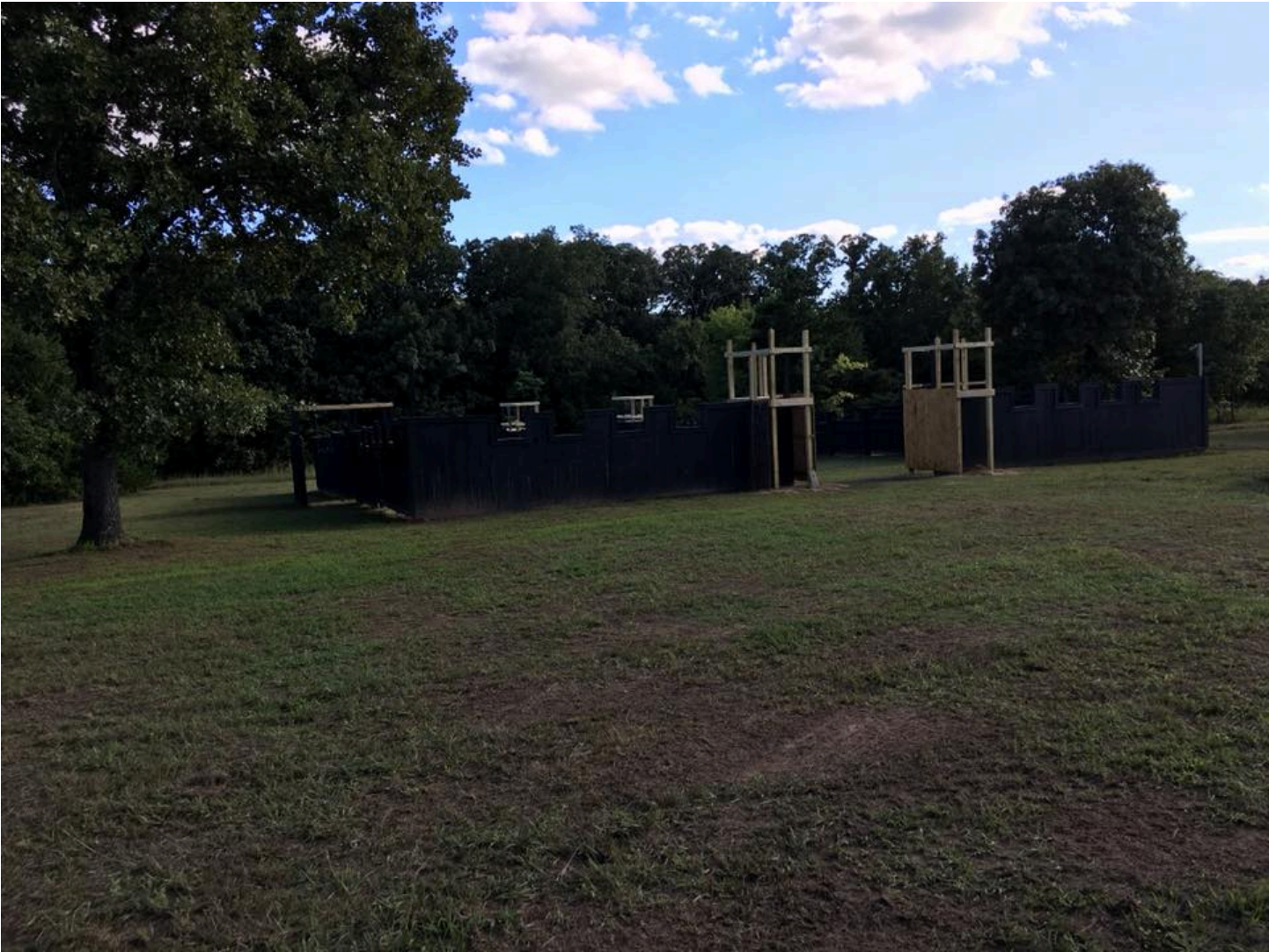
The start of the front gatehouses, end of day September 8, 2018

Our next work weekend, starting November 30 th , was mainly about the catwalks! This part of the project was spearheaded and funded by Mooneschadowe (Charles). These catwalks provide a platform for the defenders, as well as a raised level of seating for activities held inside the Fort. These are both secondary to stabilizing those walls, but we were definitely thinking of how to put the “fun” in function! By the end of the weekend the archery towers were completed and the catwalks were partially framed and decked.