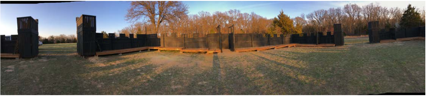
Panorama of the Fort interior

After five major work weekends, the Fort was ready to be used at events. If you haven't seen the Fort in this iteration, I would encourage you to go out and visit the next time you can. And if you're sad that you didn't get to participate in this epic project, we haven't built and hung the gates yet. There is still an opportunity to be involved!