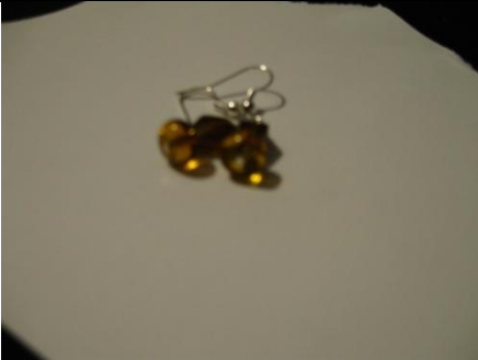
1 of 2 pairs of earrings by Lady Sarah di Rimini