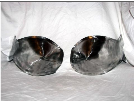
Elbow Cops made by Count Jean-Paul de Sens