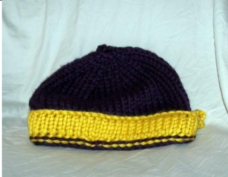
hand knitted cap in heraldic colors by by Lady Elsa von Schammach, Mooneschadowe