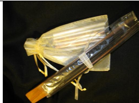
Unknown donor – presented to the prior Crown: A set of sealing waxes and incense & burner