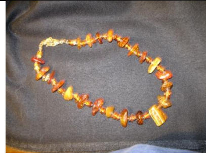
Baltic Amber necklace, sized for youth or ladies – made by Zubeydah