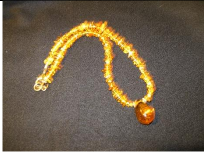
Baltic Amber necklace, sized for youth or ladies – made by Zubeydah