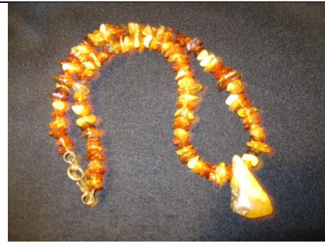
Baltic Amber necklace, sized for youth or ladies – made by Zubeydah