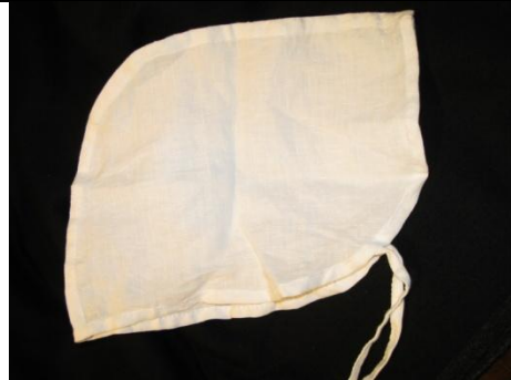
Linen arming cap, made by Lady Sarah di Rimini