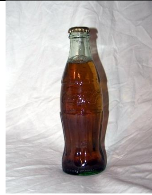
Mead, brewed by Count Jean-Paul de Sens