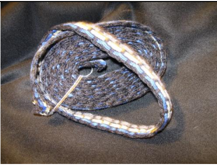
Hand Woven trim by Lady Angelique de la Fontaine of Northkeep