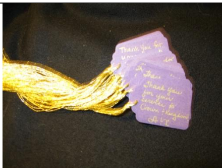
Gift Tags – made by Zubeydah