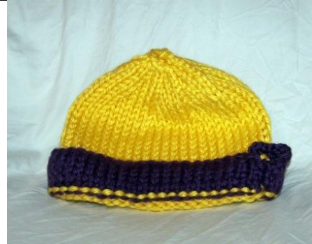
hand knitted cap in heraldic colors by by Lady Elsa von Schammach, Mooneschadowe