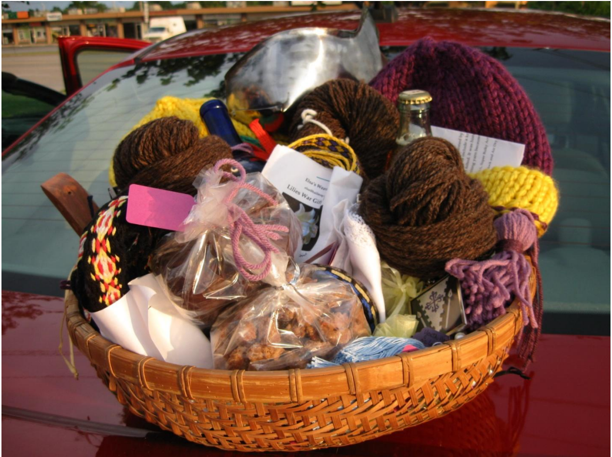
(2) 6 packs of beer by HL Matthias unfortunately not shown